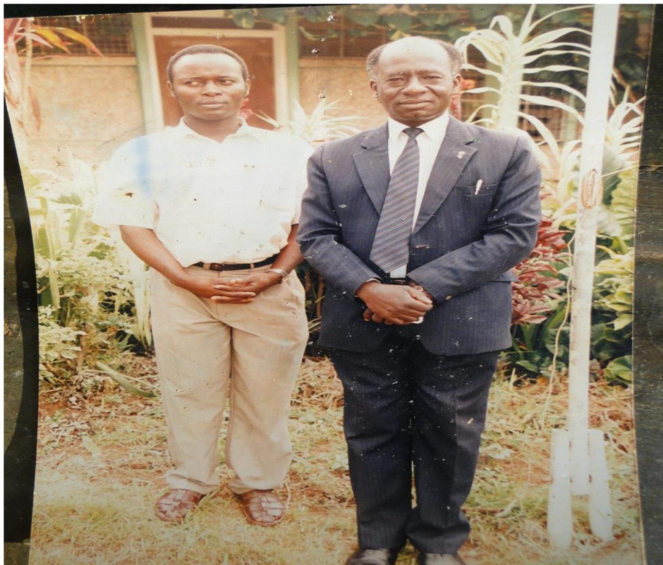
Late Kasajja Granted me chance for a Level.