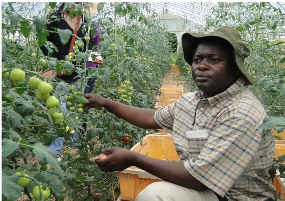
Well trained Agriculturally .