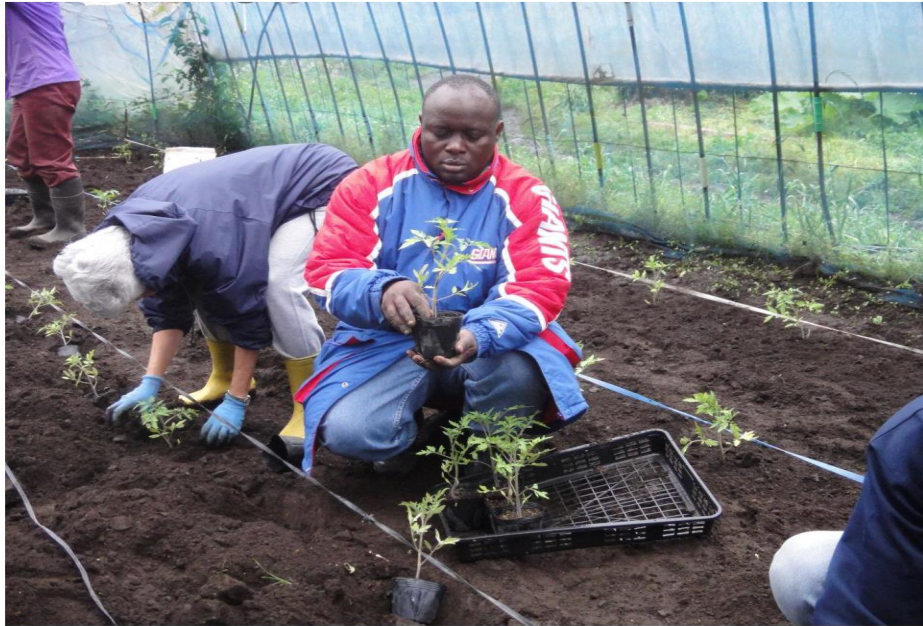
Garden organization, way forward.