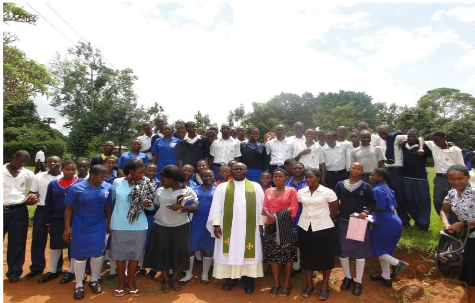
Double service, Clergy and Headteacher.