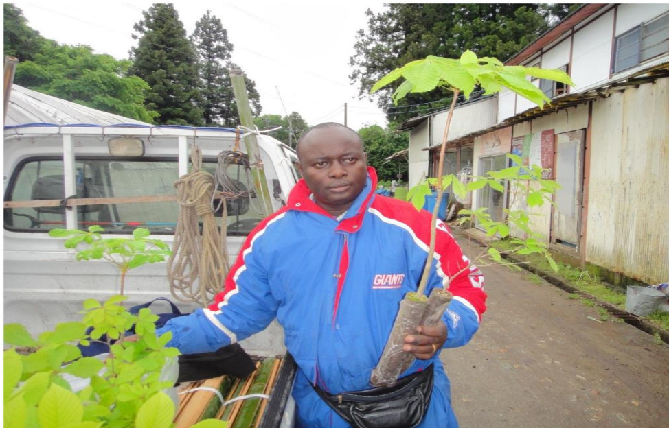
Tree planting, the way to go.

(13) EDUCATION: My wife and I being well-qualified secondary school teachers and clergy for many years, and I being a Headteacher for nine years now, we would make every effort to promote education in our areas of jurisdiction.