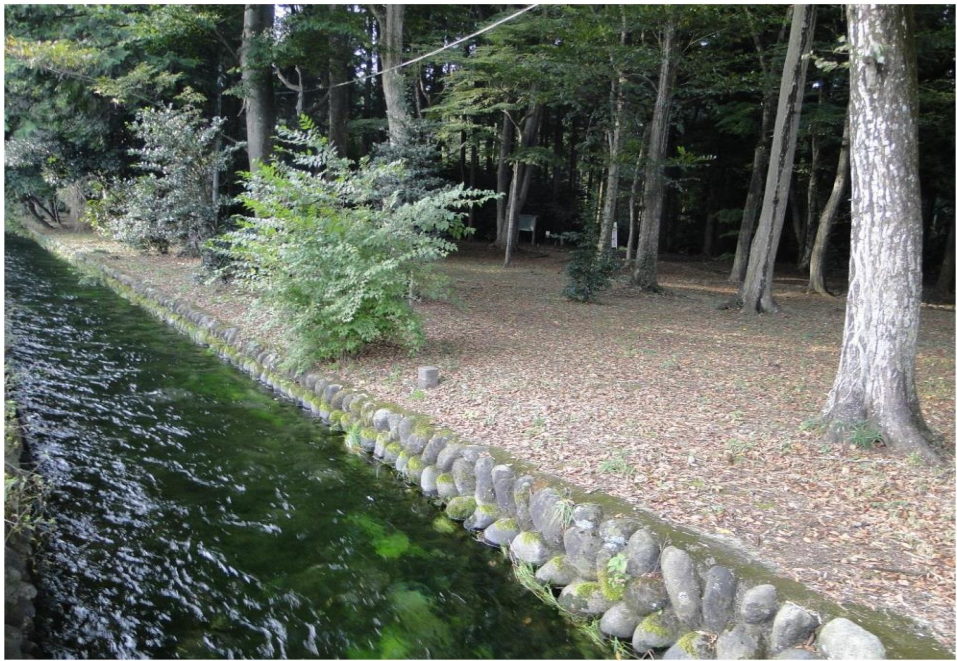
God wants such Environmental Order