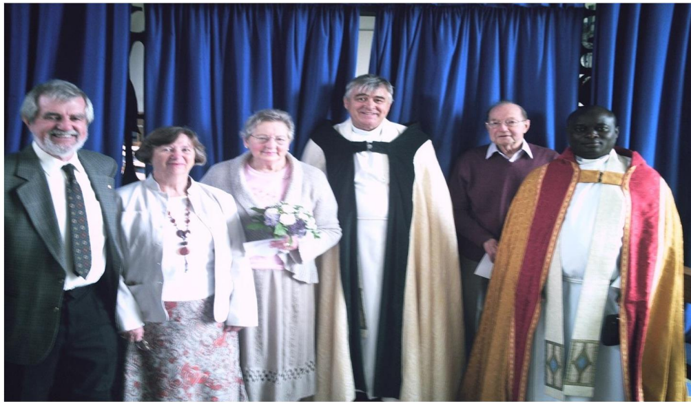
Big Assignment in the UK.