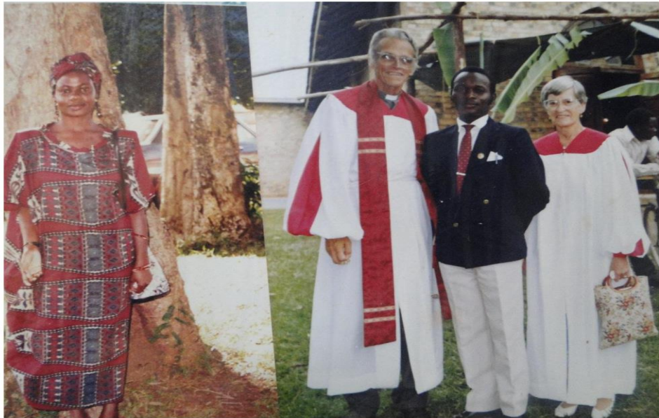
The late Grovers, my models in Chaplaincy. (RIP)