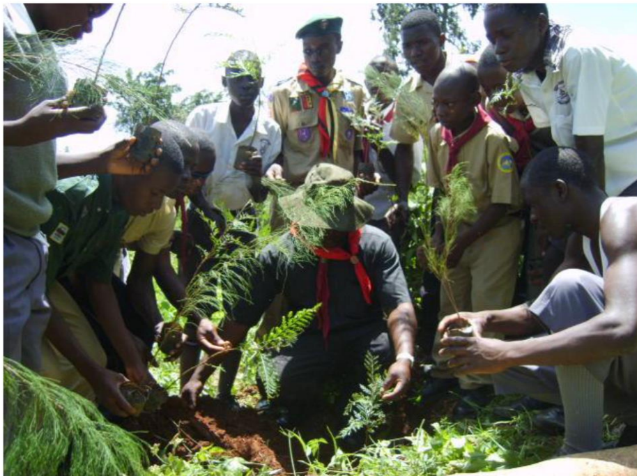
Tree planting with scouts