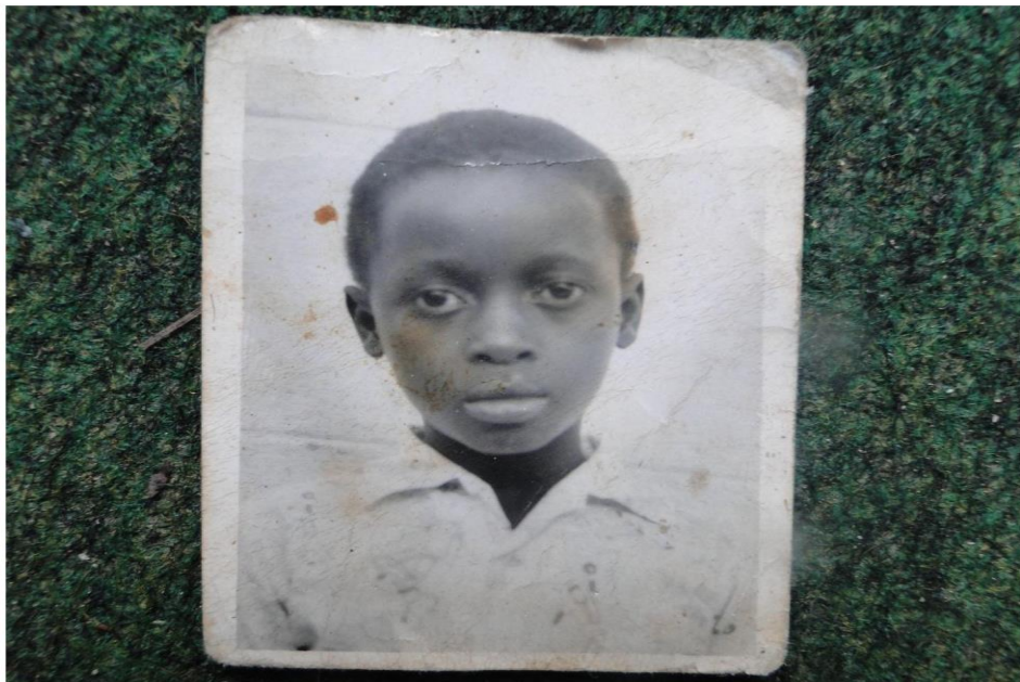
My age by Baptism.