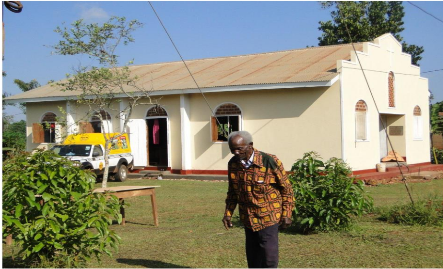
The Family Chapel.